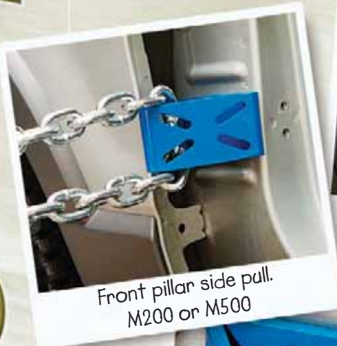
Front pillar side pull. M200 or M500

What more can we say other than... you'll be amazed by how much this small piece of equipment will add to your bottom line! Just look at the possibilities and use your imagination.