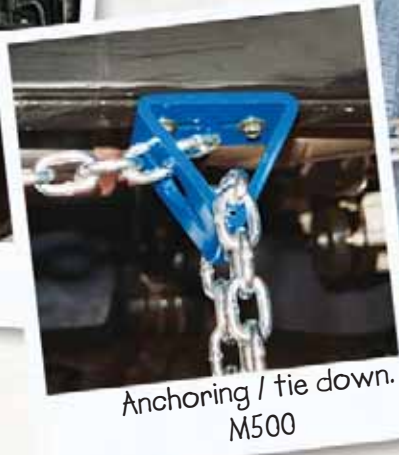
Anchoring / tie down. M500