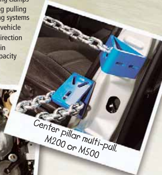
Center pillar multi-pull. M200 or M500