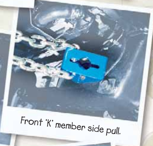
Front 'K' member side pull.