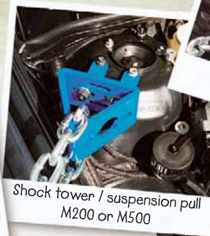
Shock tower / suspension pull M200 or M500