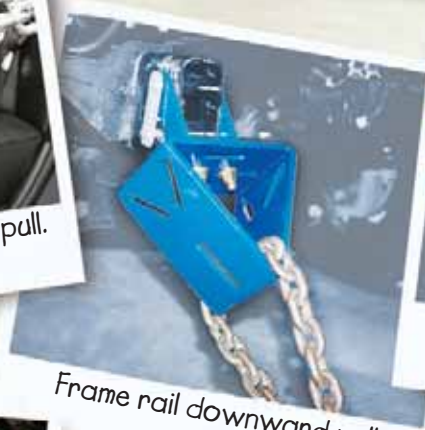
Frame rail downward pull. M600