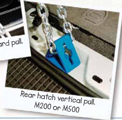
Rear hatch vertical pull. M200 or M500

Manufactured by Hi-Tac Clamp Corporation