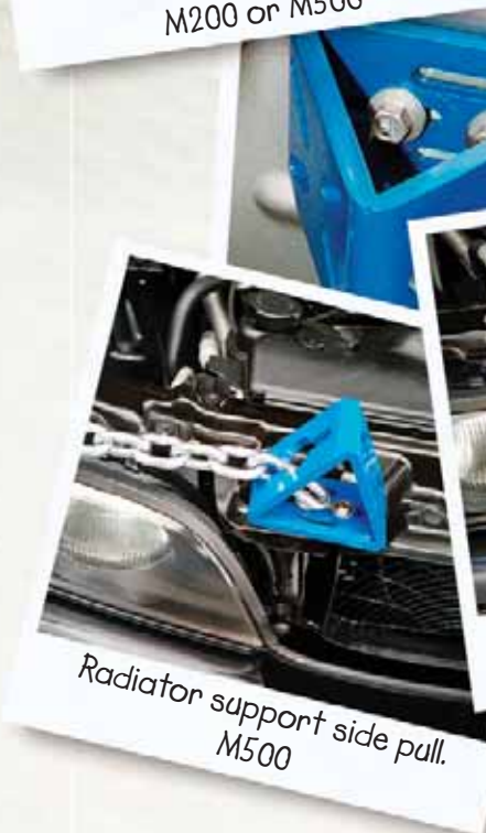
Radiator support side pull. M500