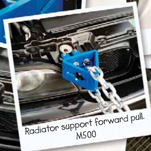
Radiator support forward pull. M500