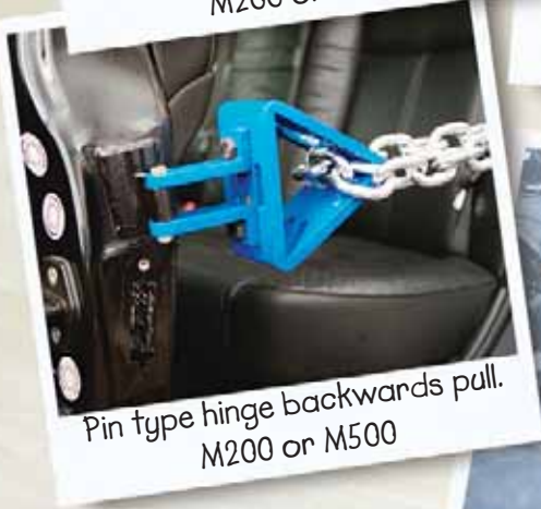
Pin type hinge backwards pull. M200 or M500