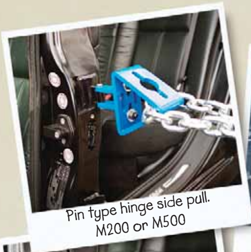
Pin type hinge side pull. M200 or M500