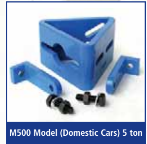
M500 Model (Domestic Cars) 5 ton

Patents, US: 6122953,6526796 Canada: 2295460. Pending: International, Taiwan