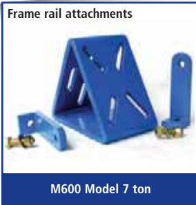
M600 Model 7 ton