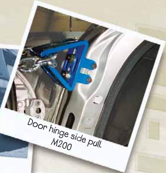
Door hinge side pull. M200