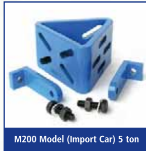
M200 Model (Import Car) 5 ton