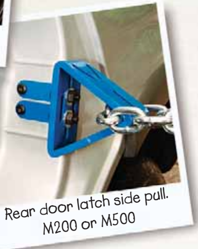
Rear door latch side pull. M200 or M500